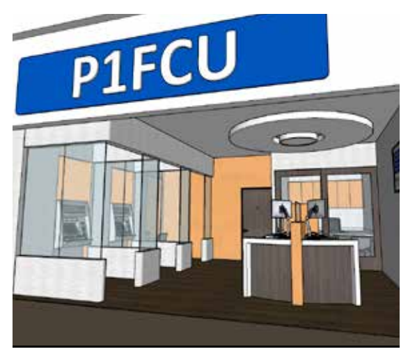
Artist rendering of the Clarkston Walmart Branch remodel